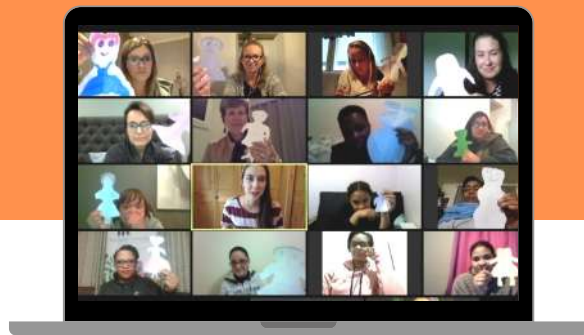
Online Dignity Facilitator Training:

As nations around the globe had to enforce different types of lockdowns in efforts to try to keep the Coronavirus from spreading, we as an organization were faced with a tough question: How do we train new facilitators when we can't gather in person? Our answer to this question was the launching of the Dignity and Dare Online Facilitator Trainings! This solution has provided the opportunity for women and men from all around the world to attend trainings and get equipped with the information and tools to reach the youth in their communities. We have witnessed the tremendous effort and creativity of the facilitators as they have found ways to implement the programmes amidst a global pandemic. This has meant social distancing, small group sizes, hosting programmes at home around a kitchen table or even outdoors. During the past year we have reached more people than ever before and the impact of The Dignity Campaign has spread further than we could have imagined.